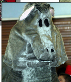
Photo DVD and Photo CD of the Christmas Assembly Available Soon - Only £5.